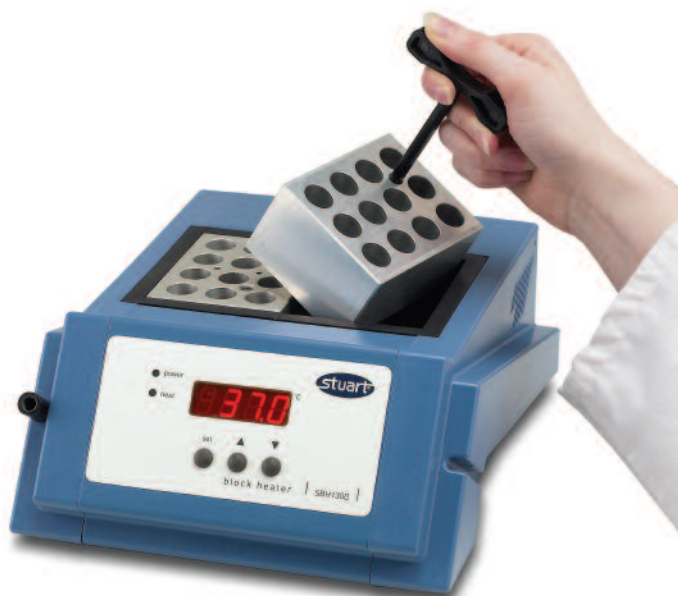
SBH130D showing block extraction tool (included)