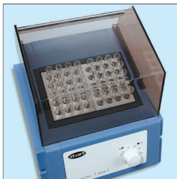
SBH130 with SBH/2