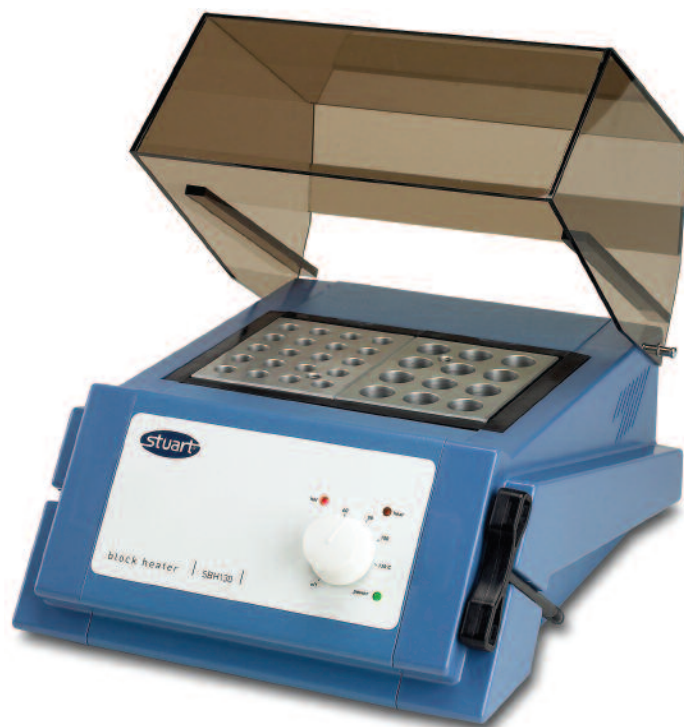
SBH130 with SBH/2