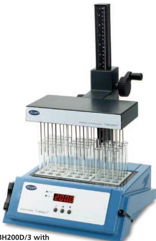
SBH200D/3 with SBHCONC/1